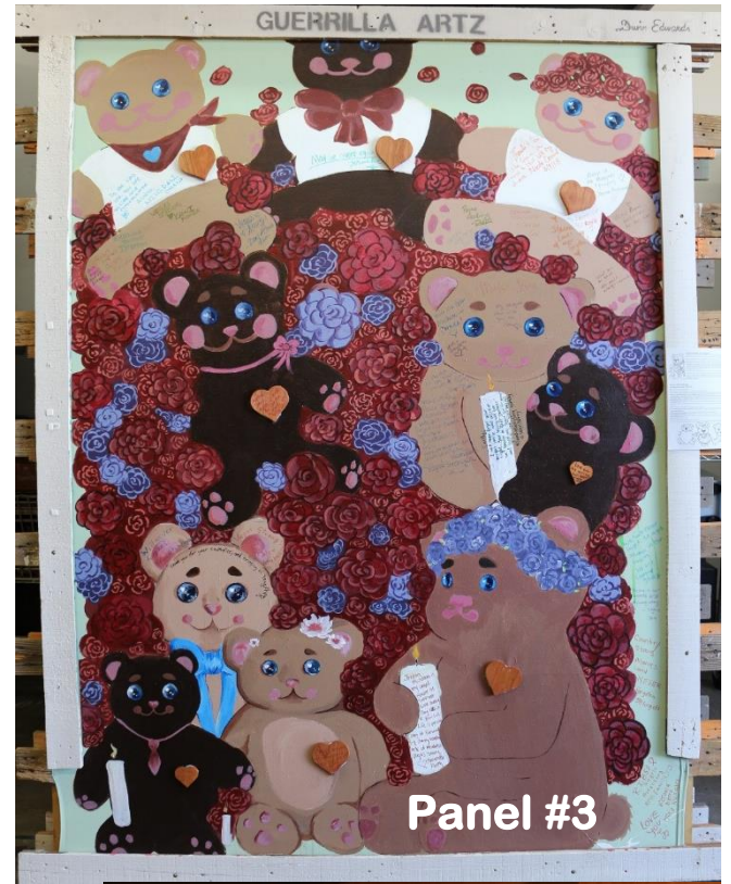
PHOTO DOCUMENTATION of EACH of the ART OF HEALING MURALS , from the 1 OCTOBER EXHIBIT, to be PURCHASED at $2500 each, for a total of $22,500 from District Artz.

Nine (9) separate 6'x8' mural panels, which can be interlocked to create 3 separate 3-sided Guerrilla Cages, if preferred, for display -